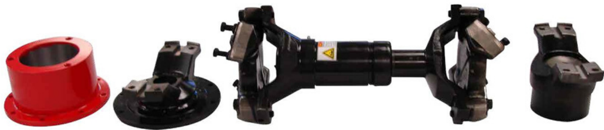
TIME SAVER TAPERED HUB #420210