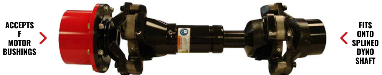
ACCEPTS F MOTOR BUSHINGS