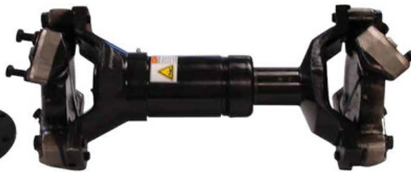
MECHANICS #9C W/U JOINTS #420101