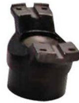
#9C YOKE BROACHED TO FIT DYNO SHAFT #420075