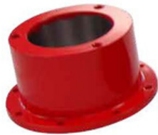
TIME SAVER TAPERED HUB #420210