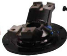
CONVERSION FLANGE #420103