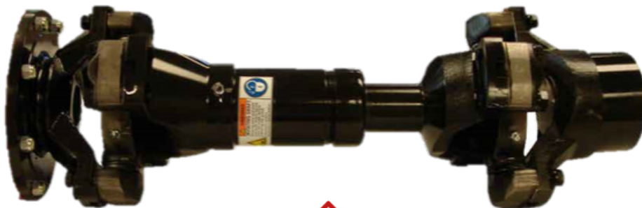
^ COMPLETE ASSEMBLED MECHANICS #9C DRIVELINE